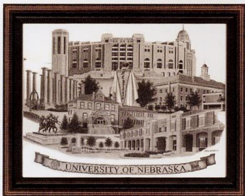
Framed size: Approximately 30 x 24"

Ivy Level $50-$99 Columns Level $100-$499 Hail Varsity Level $500-$999 Mueller Tower Level $1,000+